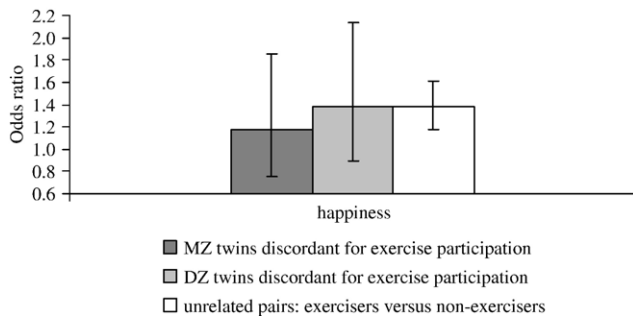
Fig. 3. The odds ratio for happiness given exercise participation. The sample consists of 8294 twins and their family members from The Netherlands Twin Registry (NTR), 2002. The error shows 95% confidence intervals.

(OR=1.18; 95% CI=0.75, 1.85). For both phenotypes, the OR for the MZ twins was close to unity and well outside the CI of the unrelated pairs.