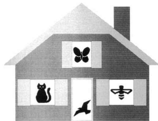
Fig. 2. An example of a stimulus shown in the memory search task.

In this task children are presented with an image of a house with four animals presented simultaneously in the windows and the door opening. An example of a