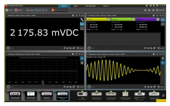
Figure 1. View measurements across USB DAQ, modular, and bench instruments all on one BenchVue interface.

The USB Modular DAQ App within BenchVue allows you to quickly configure and control any USB DAQ devices to perform data logging and visualize measurements. With six different display options, including grids and strip charts, zooming in to details the way you want is so much easier — so you can nail that measurement error in no time. You can also record measurements and export results to popular PC-friendly applications such as Microsoft Excel and Microsoft Word for further analysis in just a few clicks.