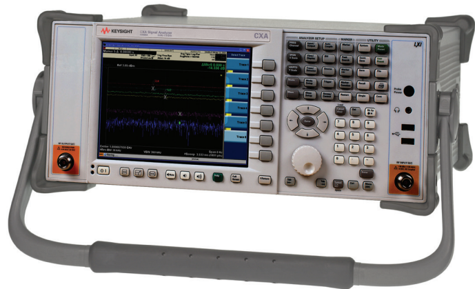
Portable configuration includes pivoting carrying handle and protective corner rubber guards (front protective cover comes standard) – N9000A-PRC