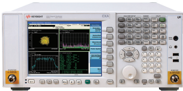
CXA bench top configuration