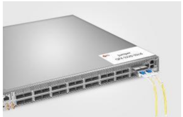
Juniper QFX 5220-32cd