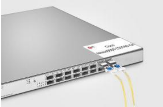
Cisco Nexus9000 C9316D-GX

Each fiber optical transceiver has been tested in host device on site in FS Assured Program to ensure full compatibility with over 200 vendors.