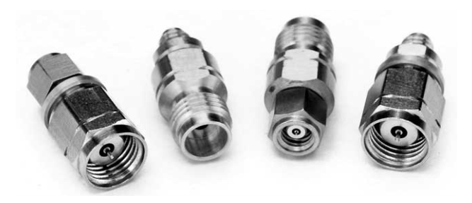
Agilent 11921E/F/G/H Adapters