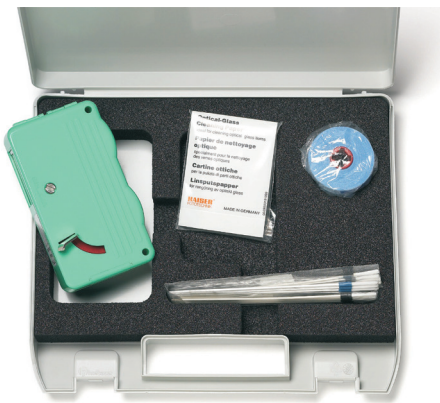
OCK-10 Optical Connector Cleaning Kit (accessory)