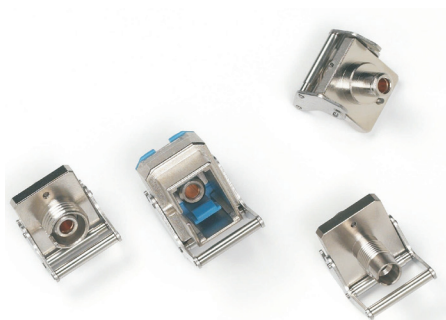
Optical adapters (BN 2150) for laser source output