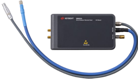
M8052A Remote head for M8043A

The M8052A remote head M8052A is required to operate the M8043A error analyzer module. The two cables on the back side of the remote head are used to connect with the M8043A error analyzer module. Using the remote head input of the M8043A module directly without the M8052A is prohibited.