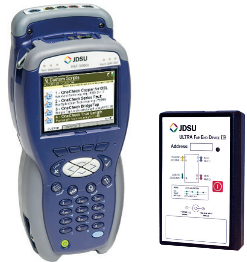
A two-ended test provides accurate fault identification for wideband services

All too often, plant records are less than 100% accurate and cannot be relied upon to provide accurate loop length. There are several ways for a technician to determine pair length independent of plant records—and each method has its own strengths and limitations.