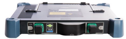
This picture is shown as a guideline only. Actual module may differ depending on the configuration selected.