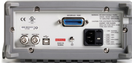
Model 2110 rear panel.

INPUT BIAS CURRENT: <30pA at 25°C. INPUT PROTECTION: 1000V all ranges (2W input). AC CMRR: 70dB (for 1kΩ unbalance LO lead). POWER SUPPLY: 100V/120V/220V/240V. POWER LINE FREQUENCY: 50/60Hz auto detected. POWER CONSUMPTION: 25VA max. DIGITAL I/O INTERFACE: USB-compatible Type B connection, GPIB (option). ENVIRONMENT: For indoor use only. OPERATING TEMPERATURE: 0° to 40°C. OPERATING HUMIDITY: Maximum relative humidity 80% for temperature up to 31°C. STORAGE TEMPERATURE: –40° to 70°C. OPERATING ALTITUDE UP TO 2000 M ABOVE SEA LEVEL. BENCH DIMENSIONS (WITH HANDLES AND BUMPERS): 107 mm high × 252.8 mm wide × 305 mm deep (3.49 in. × 9.95 in. × 12.00 in.). WEIGHT: 2.23 kg (4.92 lbs.). SAFETY: Conforms to European Union Low Voltage Directive, EN61010-1. Measurement Cat I 1000V and CAT II 600V. EMC: Conforms to European Union Directive 89/336/EEC, EN61326-1. WARRANTY: One year.