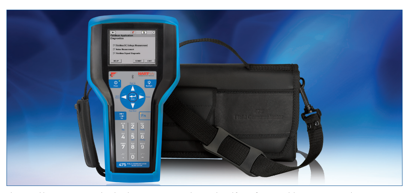
The 475 Field Communicator, with its handy carrying case, provides a single tool for configuring and diagnosing HART and FOUNDATION Fieldbus devices.