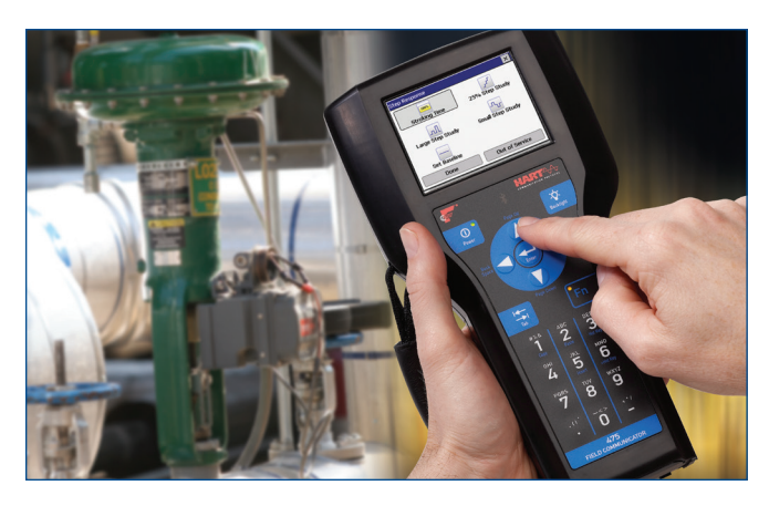
Gain advanced diagnostics in the field through ValveLink Mobile and enhanced graphics.