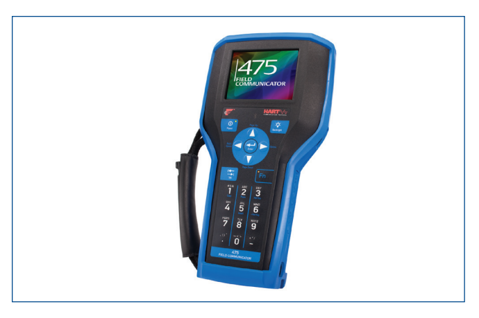
The protective rubber boot provides added protection in the field.

The intuitive user interface makes ValveLink Mobile easy to use and understand. Diagnose issues in the field or transfer the results to an asset management system like AMS Suite for in-depth analysis and documentation.