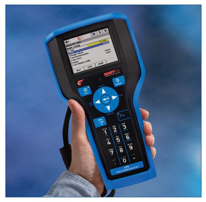
The 475 Field Communicator is designed to support all HART and Foundation Fieldbus devices from all vendors.