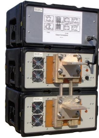
Portable Circuit Breaker Test Set