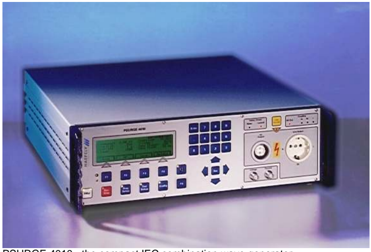
PSURGE 4010 - the compact IEC combination wave generator