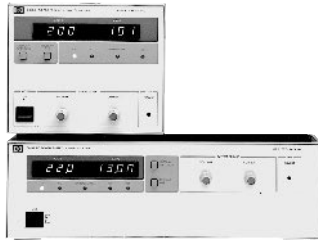
Above: HP 6023A, HP 6028A Below: HP 6010A, 6011A, 6012A and 6015A