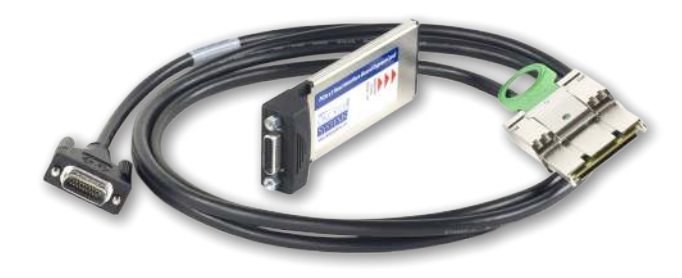
Figure 1. M9045B and Y1200B