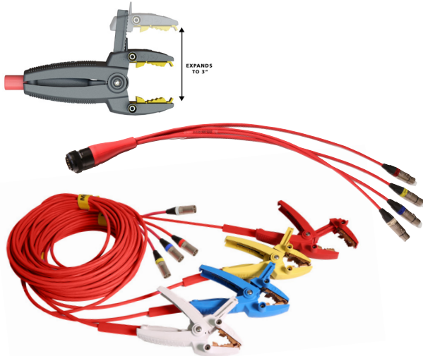
Available in 9 m (30 ft), 18 m (60 ft) and 30 m (100 ft) lengths

Newly designed test leads, shown in image below, are universal and can be used for winding resistance (MTO3XX) or turns ratio (TTR3XX) instruments. Expandable jaws, shown in inset, allow for testing any size transformer.