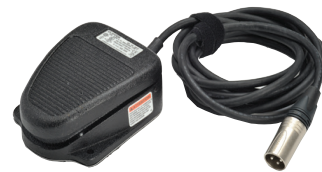
Cat. No. 1001-852

For hands-free operation, Megger offers a foot-operated safety switch. It comes with a 6.6 ft (2 m) rugged cable and an industrial rated mechanical foot pedal. This is a convenient accessory for operation of the DELTA4000 while performing routine testing