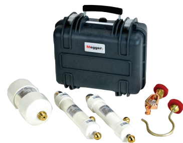
Cat. No. 36610-KIT2

Shown here: TTR cap, 2 ref caps, test hook, test clip, transit case