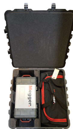
Cat. No. 2005-115