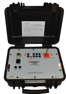
Cat. No. 2002-137

The CAL4000 is designed for use in performing calibration adjustments of the DELTA4000 series of instruments. Together with provided software, it allows for proper adjustment of critical measurements within the DELTA4000 including: tan delta (PF), capacitance, voltage, current, watts and other measurements. Operators are able to perform the calibration adjustments within a 20 to 30 minute timeframe. This tool does not replace a traceable report, only a method to bring the DELTA4000 to within specified accuracy.