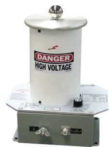
Cat. No. 670500-1