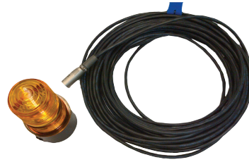
Cat. No. 1004-639

Detachable cable, 60 ft (18 m) Cat. No. 1004-532