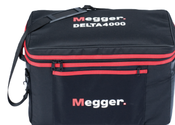
Cat. No. 2001-766