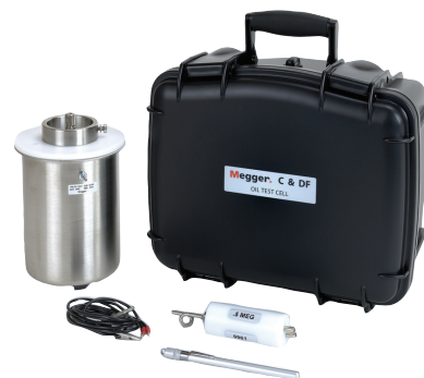
Cat. No. 670511