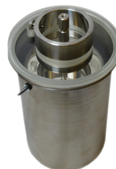
Cat. No. 1004-716