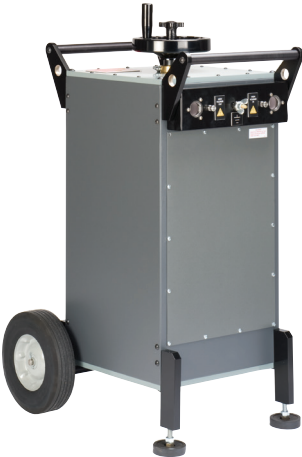
Cat. No. 670600-1