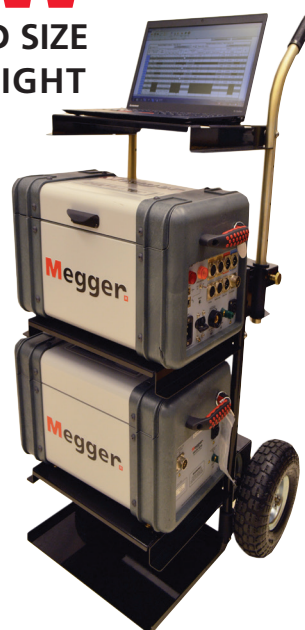
Cat. No. 2009-071