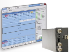
SONET/SDH test modules FTB-8115 – FTB-8120 FTB-8130 – FTB-8140