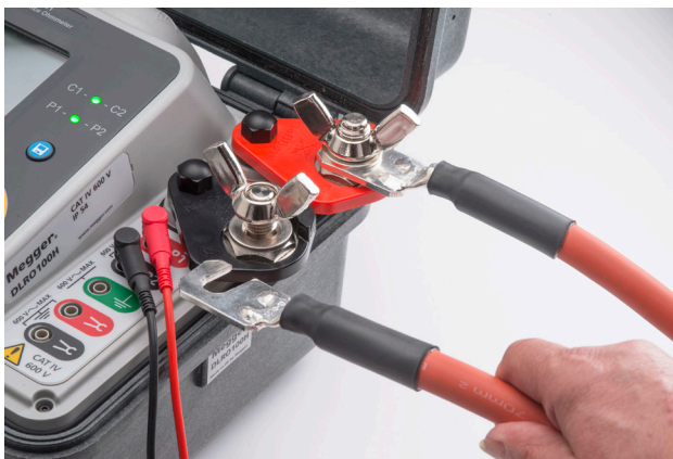
A new terminal adapter has been designed to enable the use of users own test leads.