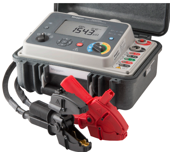
Optional CATIV 600 V Kelvin clips: two wire lead set (red/black) available in 5m, 10m or 15m lengths