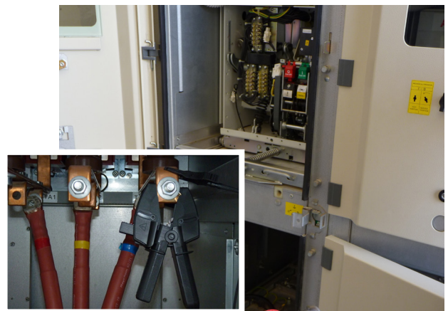
DLRO100H testing rack-mounted, 3-phase circuit breakers