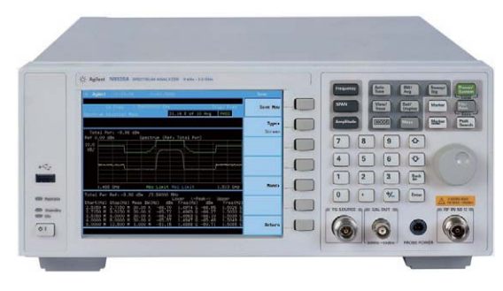
N9320A Spectrum Analyzer

All the essentials of an Agilent spectrum analyzer with a price/performance that's easy to afford