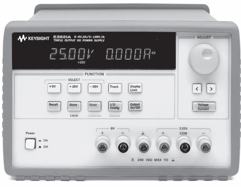
Figure 1: E364X: Basic System Power