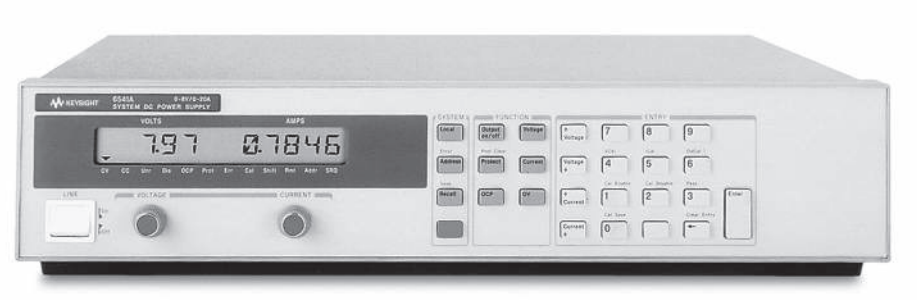
Figure 3: 6600 Series High Performance System Power Supply