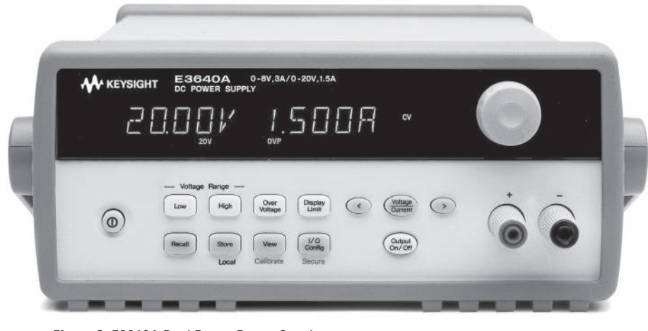
Figure 2. E3640A Dual Range Power Supply