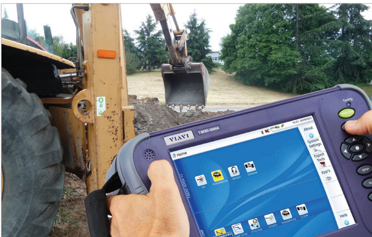
Portable and upgradeable platform with interchangeable test modules increases technician productivity

The flexibility of interchangeable module carriers and various plug-in modules let users create a platform that meets today's specific testing needs and yet it can evolve seamlessly to meet tomorrow's ever-changing network requirements.