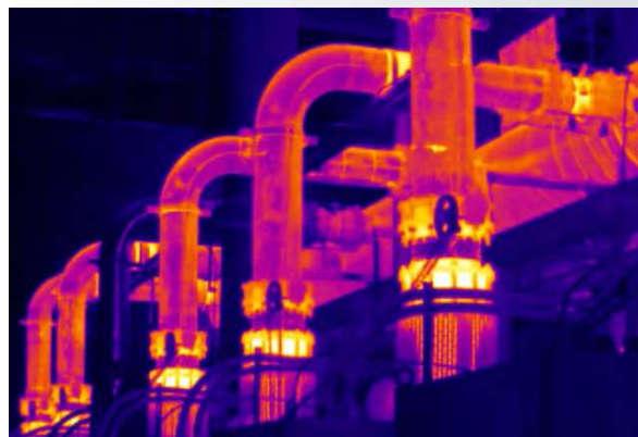
MultiSharp Focus, available on the RSE300 and RSE600 Infrared Cameras