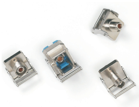
Optical adapters (BN 2150) for laser source output