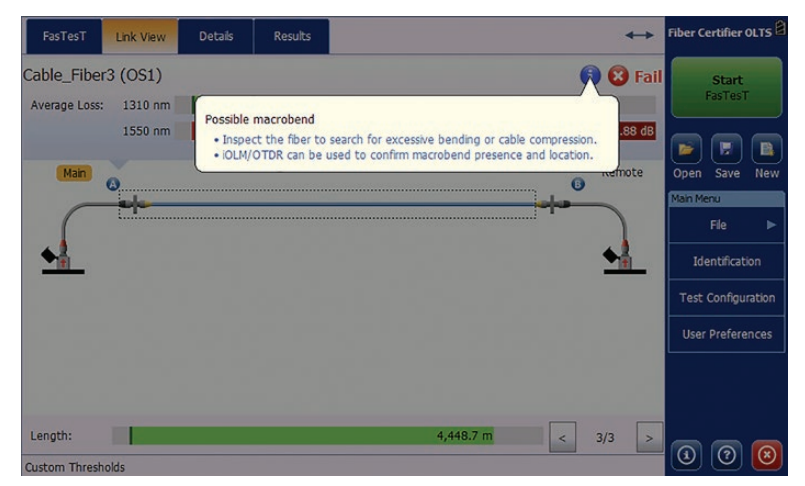
On-board diagnosis helps the technician take proper action