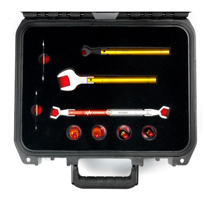
Figure 3. N1060A-60005 accessory kit