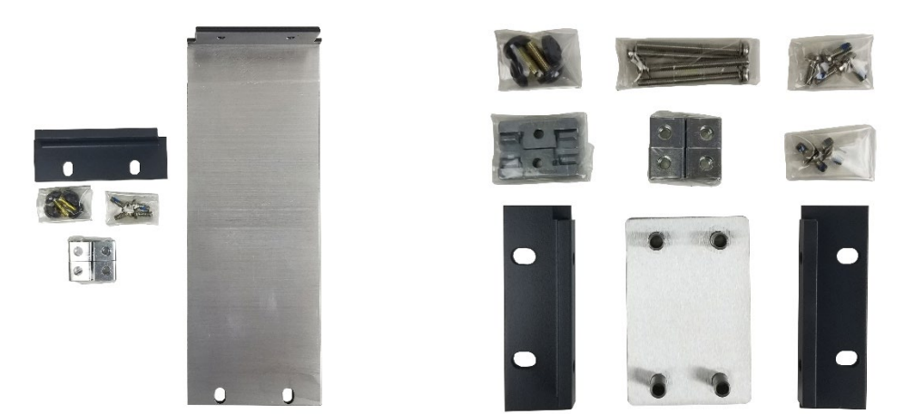
Figure 20. N1027A-RM1 (left) and N1027A-RM2 (right)