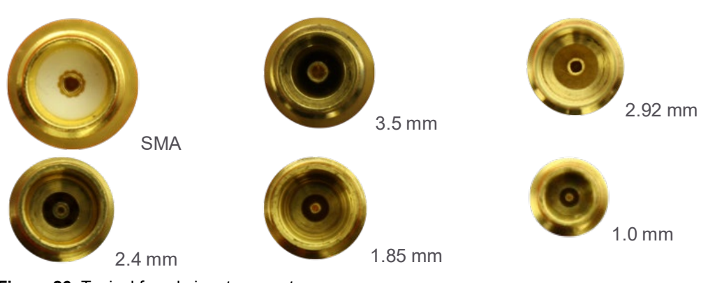
Figure 26. Typical female input connectors