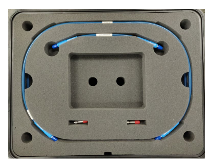
Figure 9. N1078A-CR1/N1027A-78A accessory kit