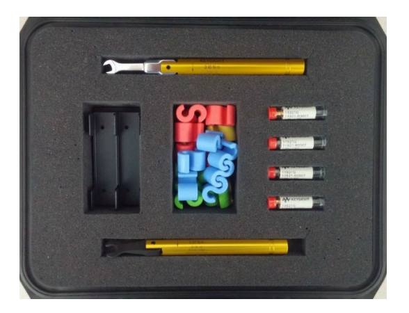
Figure 2. N1027A-A4F accessory kit