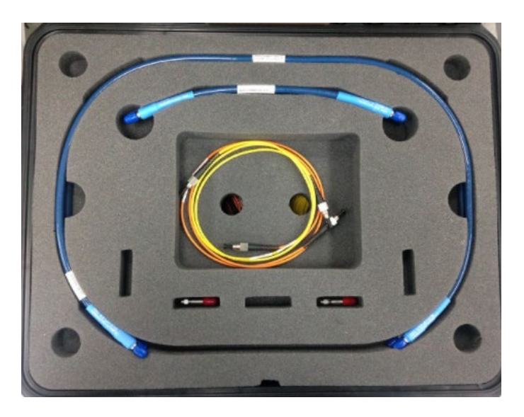
Figure 8. N1077A-CR1/N1027A-77A accessory kit