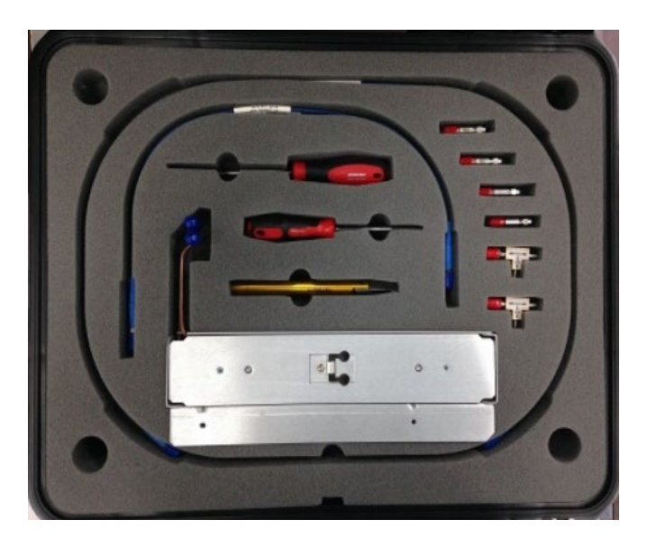
Figure 7. N1076B-CR1/N1027A-76B accessory kit