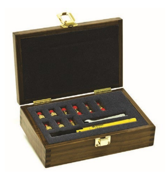
Figure 6. 85058E economy mechanical calibration kit

All kits provide SOLT calibration except the N1024B which is limited to SLT.