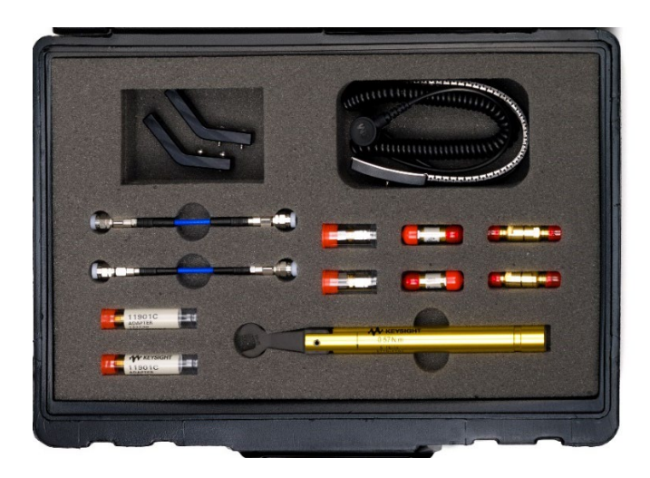
Figure 1. N1027A-45A demo kit