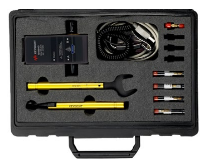
Figure 4. N1027A-54F accessory kit