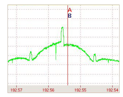
Laser chirp identification with I-PMD high-resolution spectrum analysis