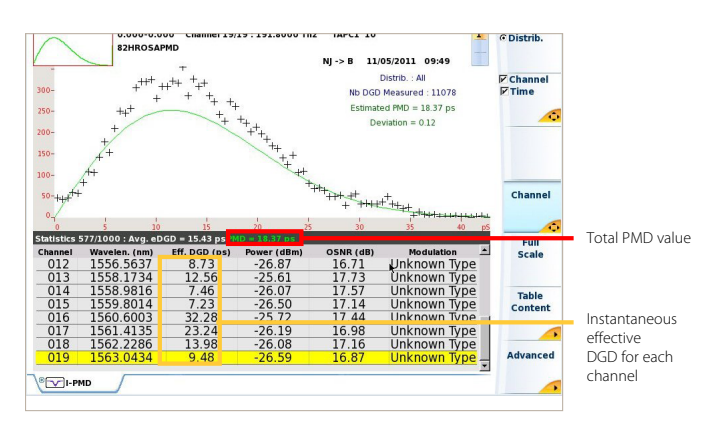
Effective DGD and PMD measurement of 10 G DWDM channels