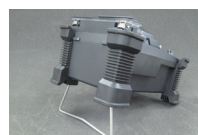
⑤ Angled Stand in Action