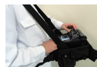
⑥ -1 Working Belt in Action