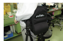
⑥ -2 Working Belt in Action