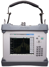
PIM Cable and Antenna Testers