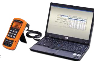
Figure 1: Automate the recording of continuous readings when you hook the U1731A/U1731B/U1732A/U1732B to a PC