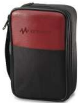
U1174A Soft carrying case