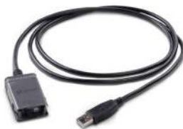
U5481A IR-to-USB cable