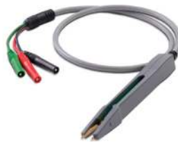
U1782A SMD tweezer