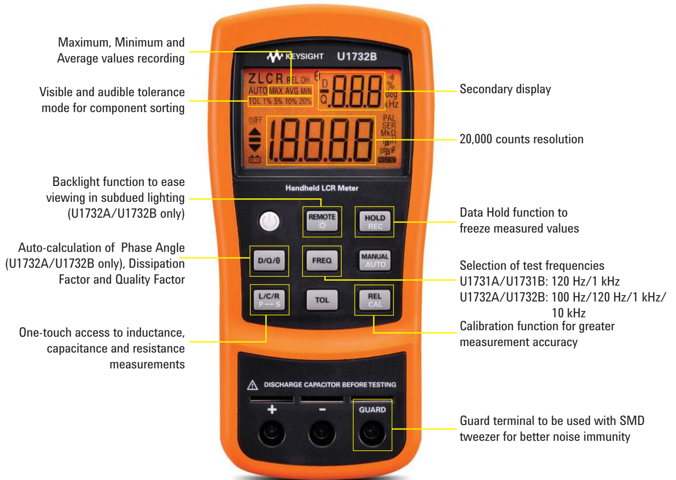
Figure 2: U1732B front view