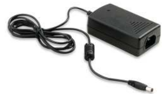
U1780A Power adapter and cord (according to country)