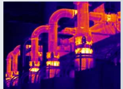
MultiSharp Focus, available on the Ti450 PRO