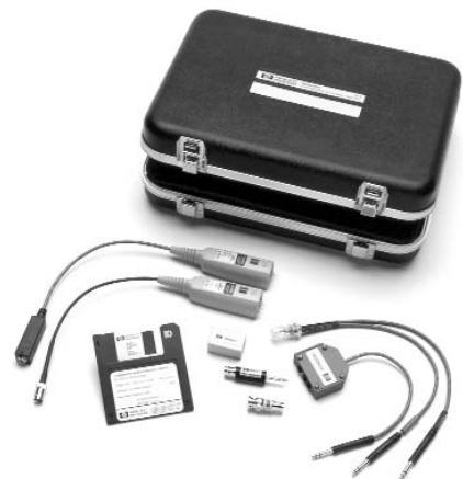
E2625A Communications Mask Test Kit provides a 1.44MB floppy with the mask templates as well as a number of hardware connectors and adapters.

Use the mouse or Infiniium's keyboard to add labels or notes to your screen images, then save them to the floppy or hard disk. The built-in LAN interface makes it easy to transfer these images to network computers so you can share or document your work. You can also print the waveform to local or network printers.