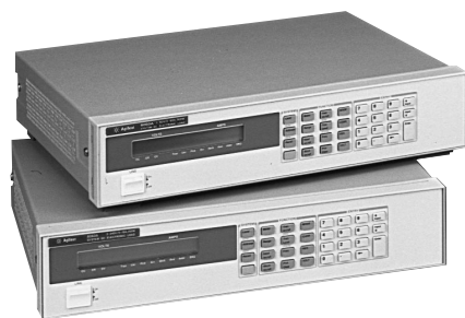
6060B and 6063B

Cost-effective for single input applications Convenient optional front panel input connection