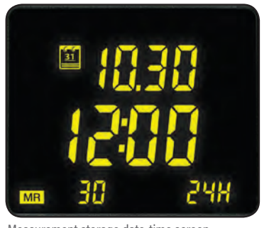
Measurement storage date-time screen