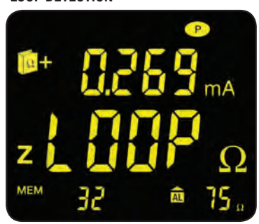
Detects and displays possible false readings associated with metal loops