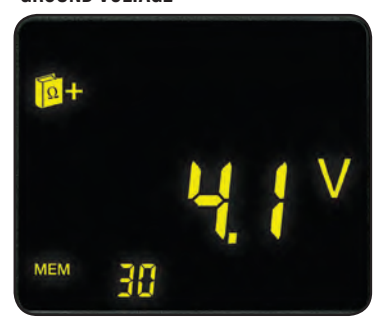
Indicates voltage potential at the point of measurement