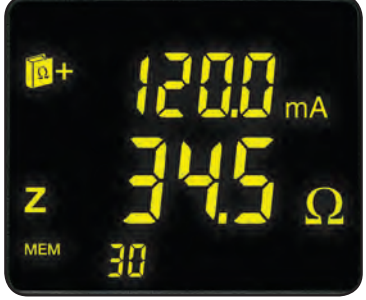
Displays the leakage current and loop impedance at the test frequency