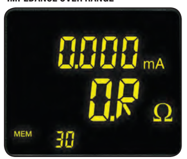
Indicates that the impedance is greater than 1500 \Omega