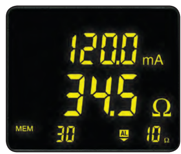
Indicates voltage/current alarm threshold along with the direction of impedance