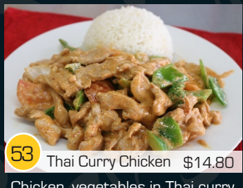
Chicken, vegetables in Thai curry sauce, served with steamed rice