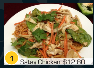
Thick egg noodles, chicken, vegetables, satay sauce