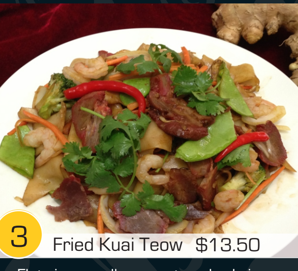
Flat rice noodles, roast pork, shrimp, vegetables, dark soy & mild chilli sauce