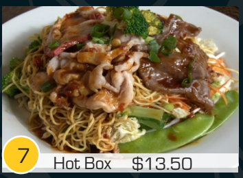
Thin egg noodles, roast pork, chicken, beef, vegetables, Thai chilli sauce