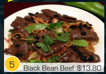
Thick egg noodles, beef, vegetables, black bean sauce