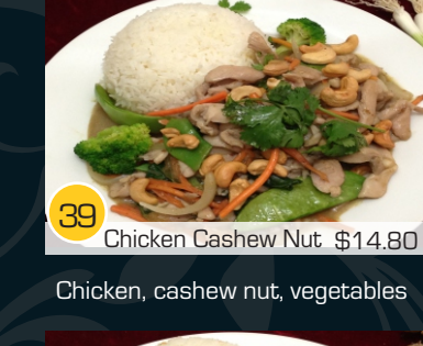
Chicken, cashew nut, vegetables