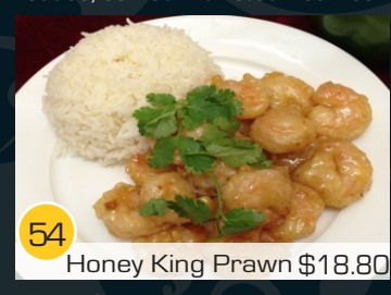
Deep fried king prawns in honey soy sauce with steamed rice