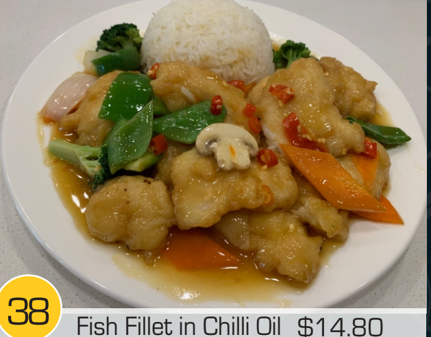
Deep fried fish fillet, vegetables chilli oil, steamed rice