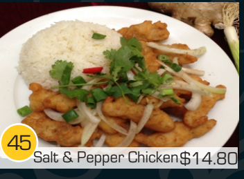
Deep fried chicken, salt & pepper