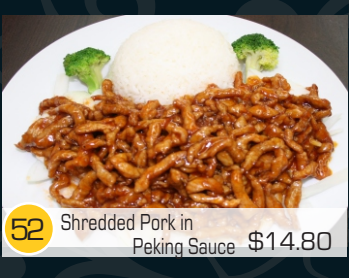
Pork, onion, Peking sauce