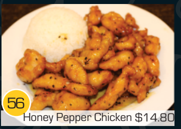
Chicken in honey pepper sauce with steamed rice