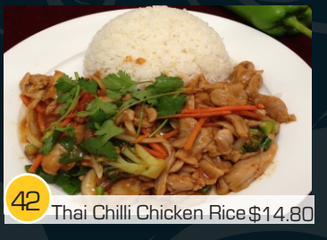
Chicken, veggies, Thai chilli sauce