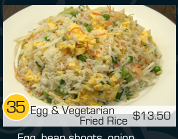
Egg, bean shoots, onion, carrots, spring onion, peas