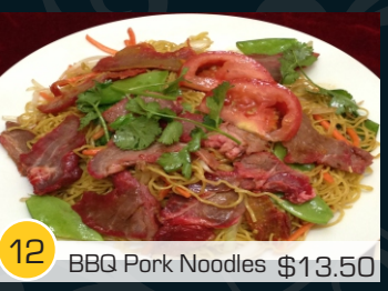
Thin egg noodles, roast pork, vegetables, Chinese BBQ sauce