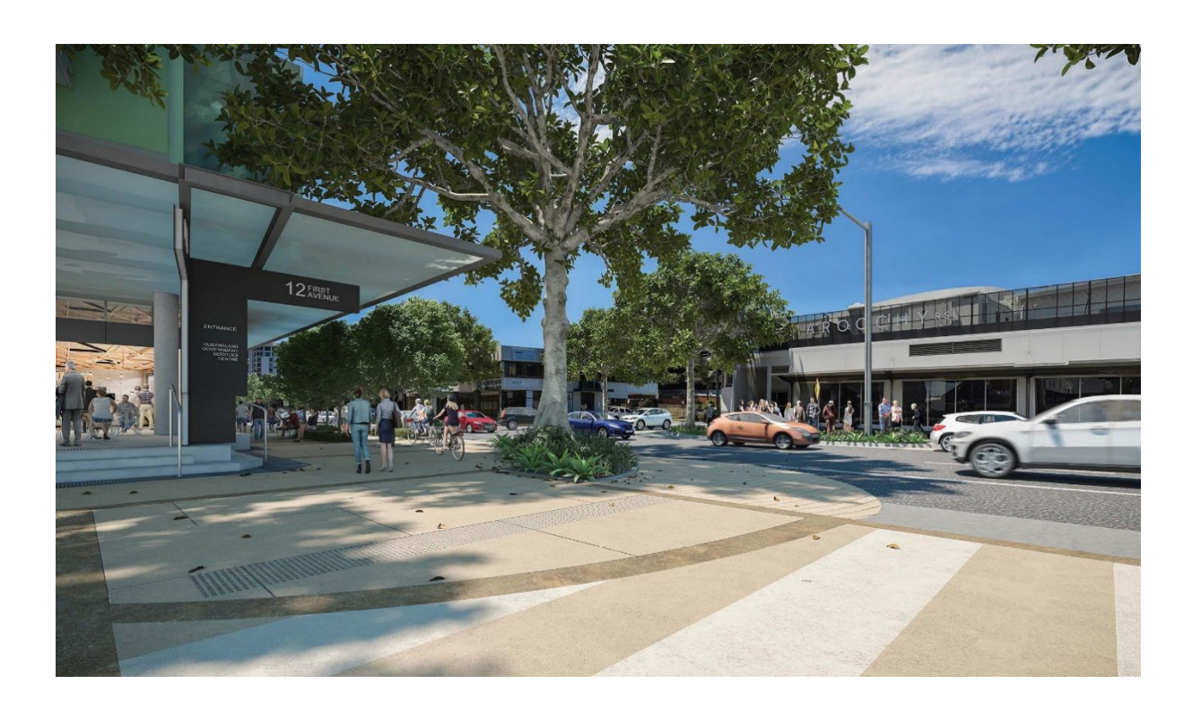
Artist impression concept design – Cornmeal Parade view