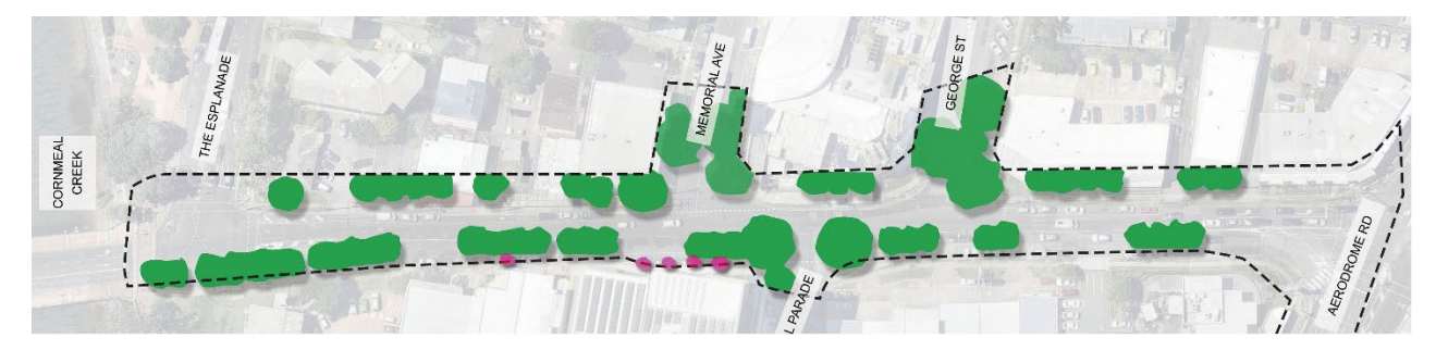
Figure 3 - Indicative Planting Plan of First Avenue Upgrade – 5 before (pink) and 60 after (green) upgrade. With also be approx. 1500 plants for underplanting.