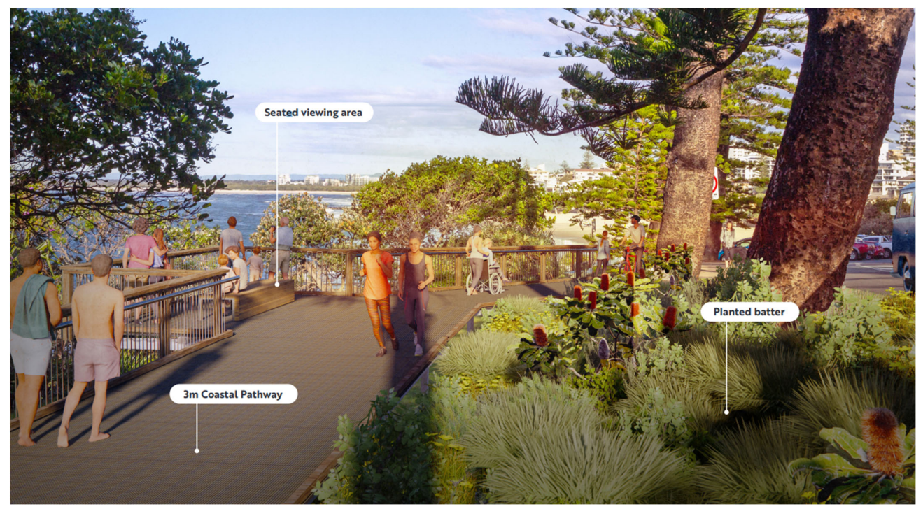
Figure 2 - Artist's impression of boardwalk and revegetation works, including new planted area between boardwalk and road