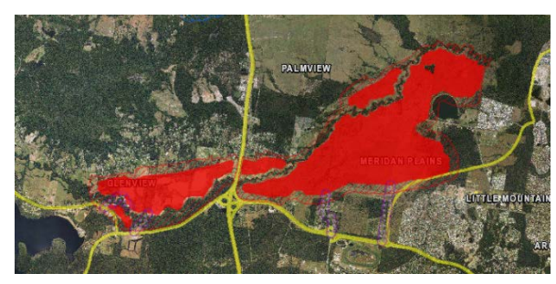
Figure 1 Meridan Plains (right) and Glenview (left)

The Meridan Plains ERA is located within the Mooloolah River floodplain, to the east of the Bruce Highway and the Glenview Key Resource Area, and between Caloundra Road and the Palmview Structure Plan Area (refer Figure 1 ).