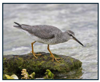
Grey-tailed Tattler in breeding plumage.

General: Grey-tailed are slightly smaller and slightly paler than Wandering and generally prefer mudflats and sandy beaches. Wandering are found almost exclusively along rocky shorelines, occasionally accompanied by Grey-tailed.