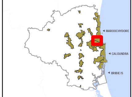
Figure 7.2.19A (Maroochydore/Kuluin Local Plan Elements)