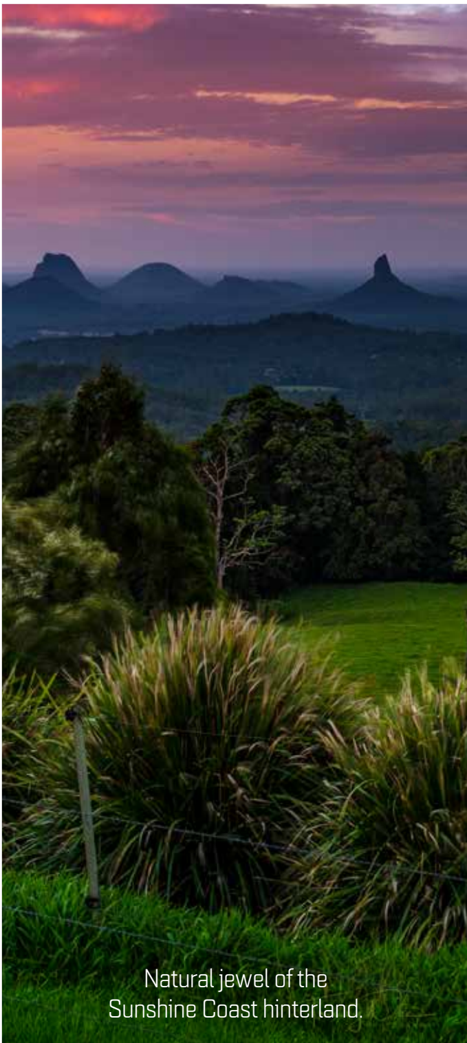
Natural jewel of the Sunshine Coast hinterland.