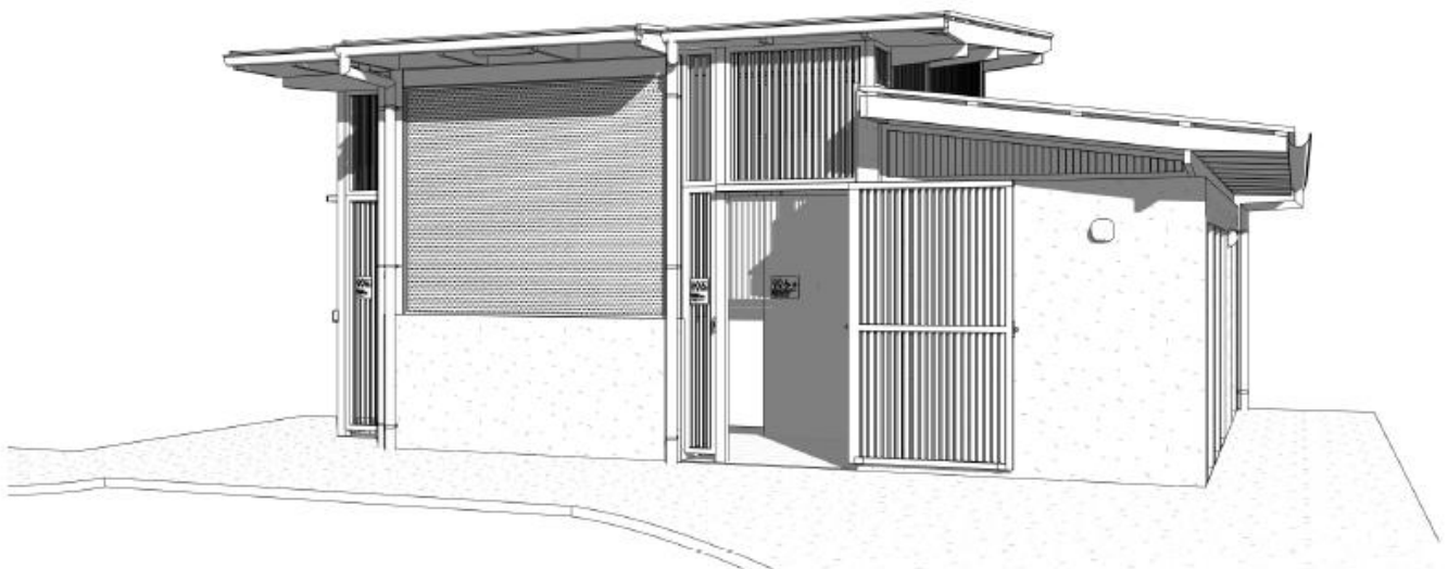
VIEW FROM CARPARK