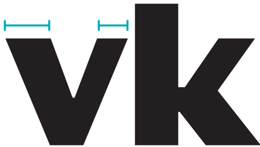
Noticeable stem difference