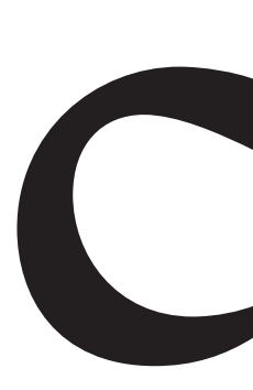
Details for display sizes