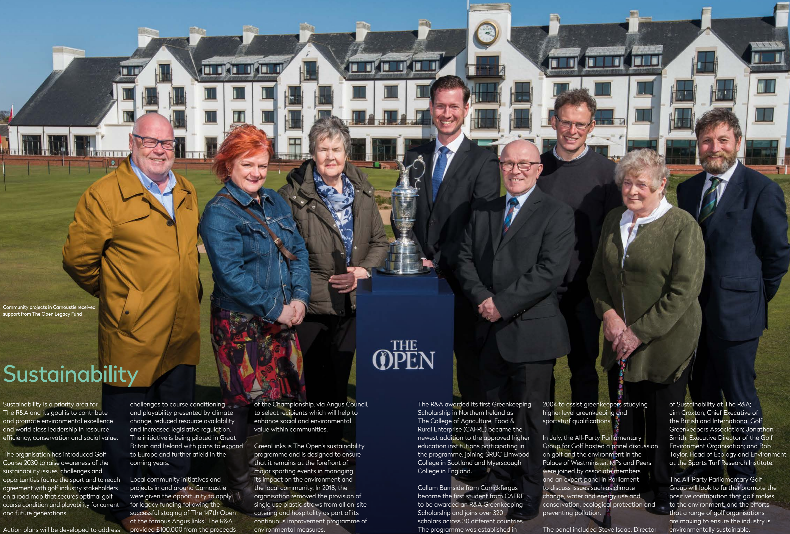
Community projects in Carnoustie received support from The Open Legacy Fund