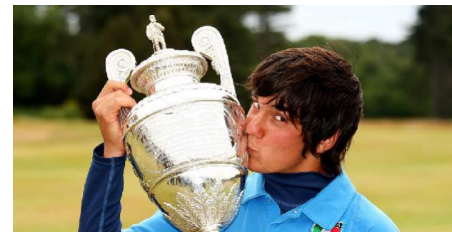
Matteo Manassero, 2009 Champion

England's GRAEME STORM continued a run, begun by Garcia in 1998, with his 1999 win at Royal County Down that would see four straight champions go on to become DP World Tour winners. Storm has two victories. Finland's Mikko Ilonen amassed five wins before announcing his retirement in 2019. Northern Ireland's Michael Hoey graduated from his 2001 win to match Ilonen's five tournament win tally.