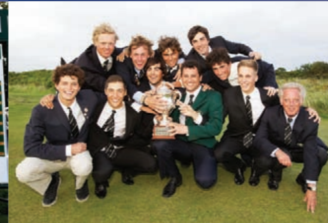
The Continent of Europe wins the Jacques Leglise Trophy match at Portmarnock