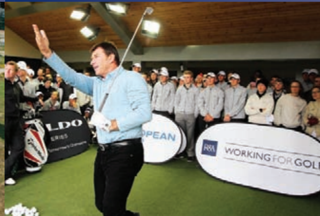
The R&A backed Faldo Series 2012 is set to benefit 7,000 players in 27 countries