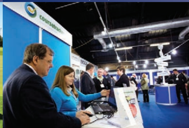
courstracker.org is launched at the BIGGA trade show in Harrogate