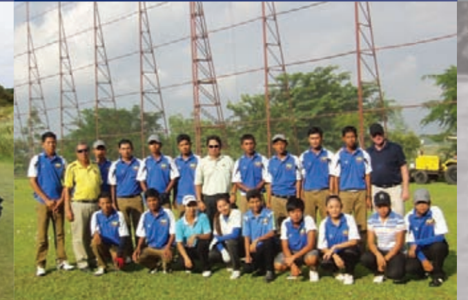
The R&A supports the national team and coach education in Myanmar