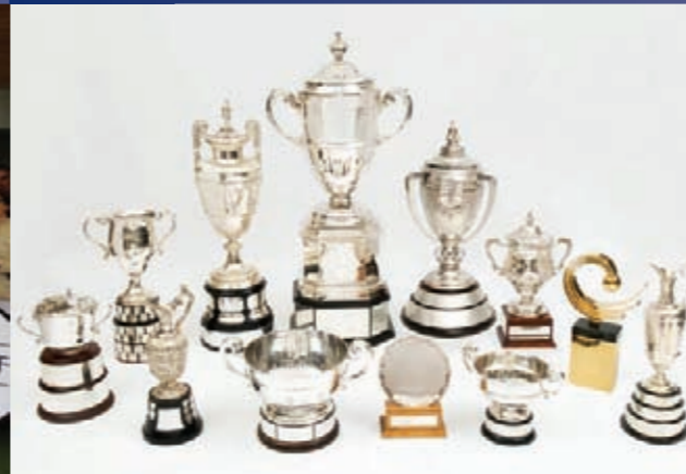
Championship Trophies gathered as Rolex announces support through 2020