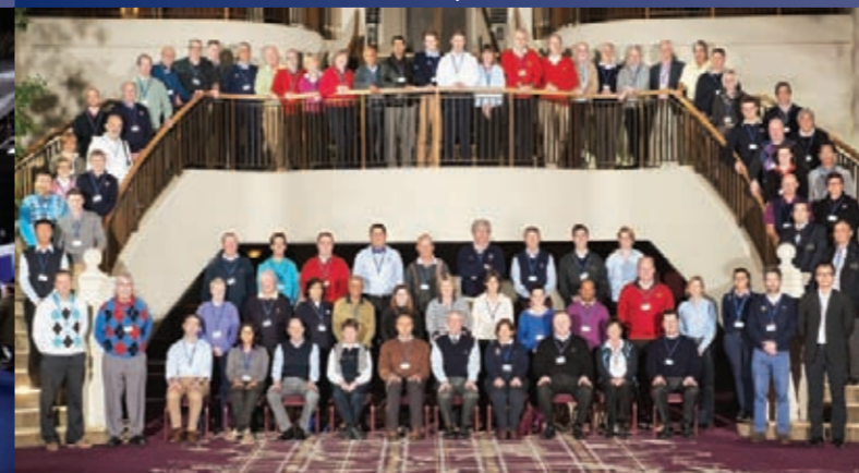
The annual Tournament Administrators and Referees School in St Andrews