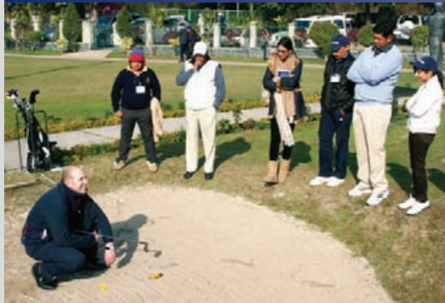
The inaugural R&A and Indian Golf Union Joint Rules of Golf School in Chandigarh