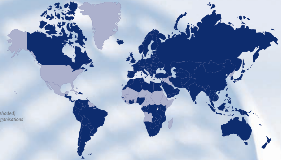
Right: Map – 135 countries (shaded) host national golfing organisations affiliated to The R&A