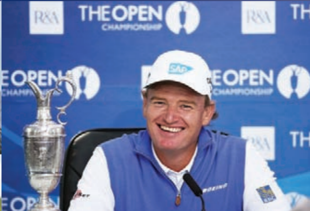
The Open Champion for a second time, Ernie Els, meets the media at Royal Lytham & St Annes