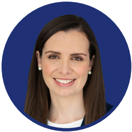
THE HON. COURTNEY HOUSSOS, MLC

Minister for Natural Resources, Minister for Finance