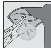
Figure 3 Position tag in the center portion of the front side of the ear.