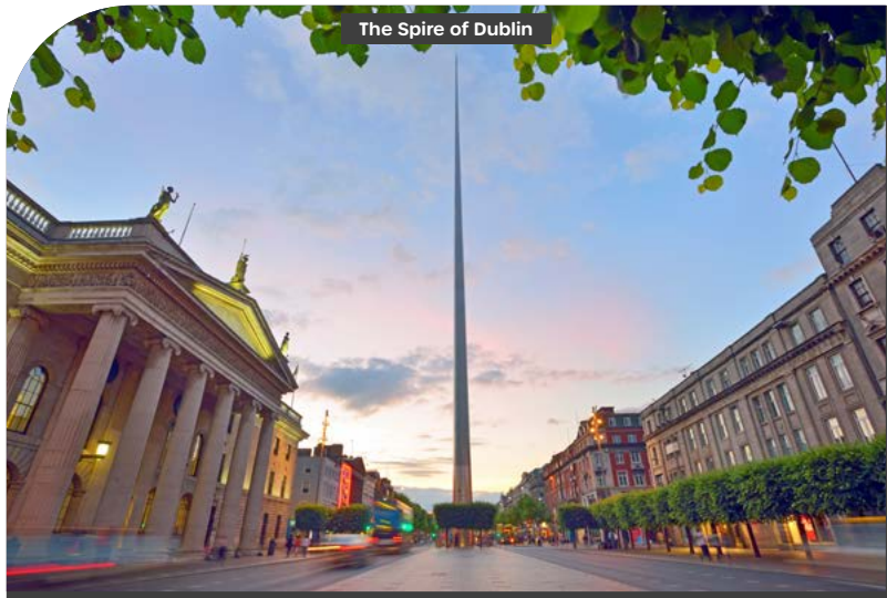
The Spire of Dublin