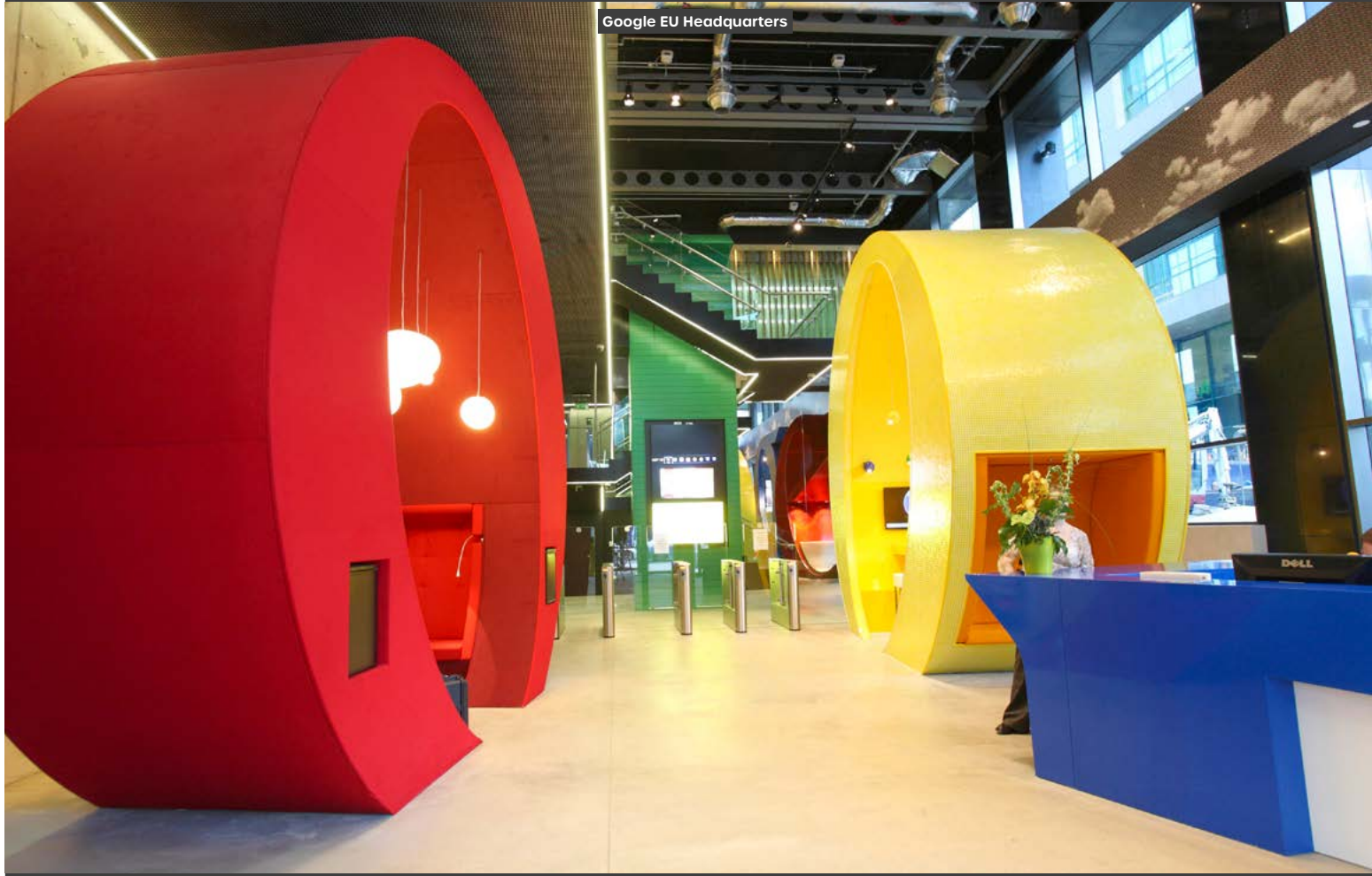
Google EU Headquarters