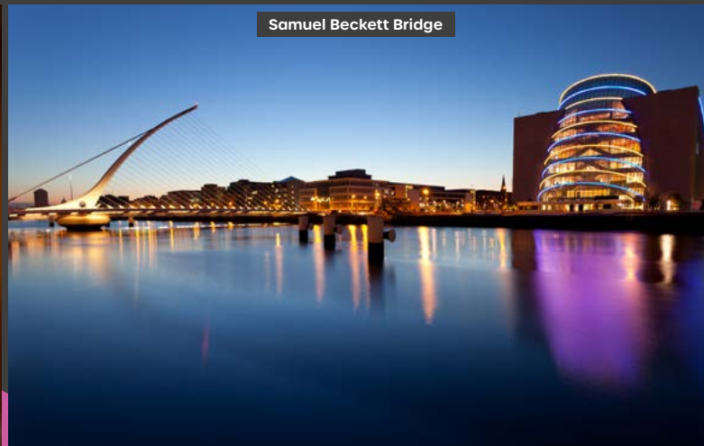
Samuel Beckett Bridge